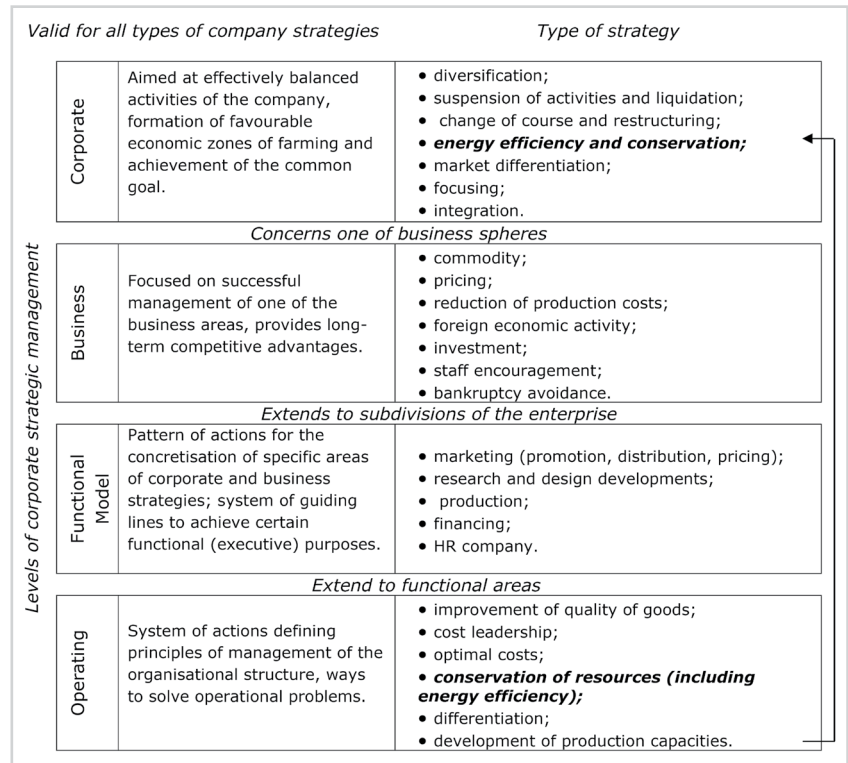
Fig. 2: The place of energy-saving strategy in the formation of a strategy of an agrarian business

At the operational level, strategies are focused on the increase of competitiveness of each link of business, organisation and implementation of strategies of a higher level. There-