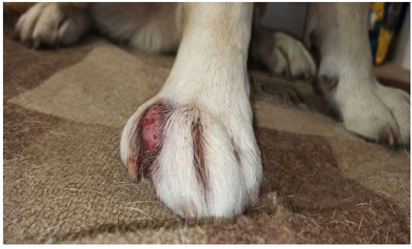
Figure 1. Inflammation of the dorsal side of the pastern