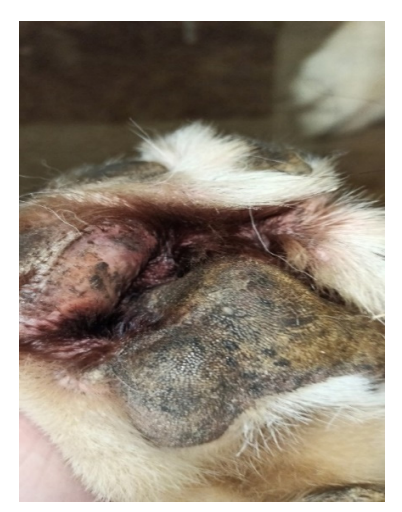
Figure 2. Inflammation of the plantar side of the pastern