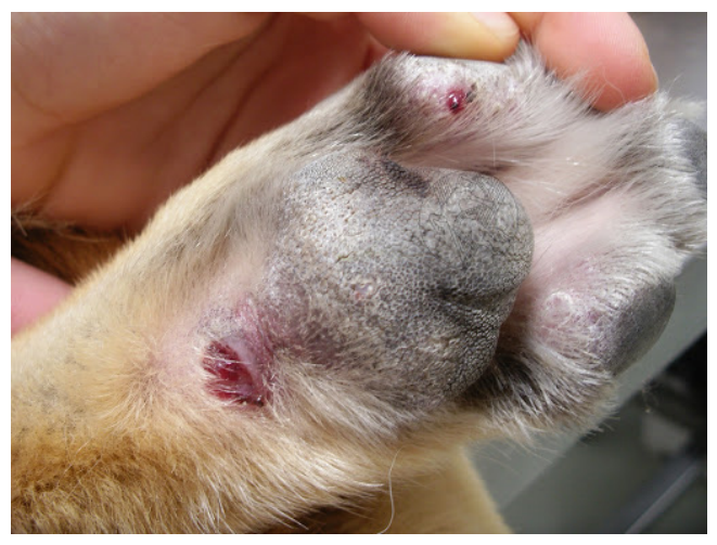
Figure 3. Metatarsal panniculitis in dogs

Another important criterion for establishing a clinical diagnosis was the visualisation of the variability of tissue damage at the site of inflammation. Thus, the external signs of pododermatitis in dogs were: alopecia,