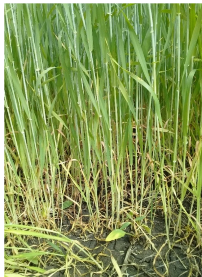
Figure 2. Helios spring barley plants in the earing phase (2020)