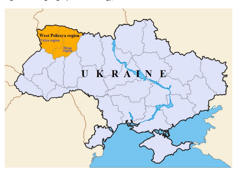
Figure 1. Western Polissya region on the map of Ukraine

In 2019, the share of regional rural residents was 50%. Due to the low level of urbanization, the average population density (54 people per km²) is much lower than the national average, the lowest among all economic regions. There is a significant surplus of labor resources in the region, especially in rural areas. This leads to significant pendulum migrations and departure of residents for seasonal work both within Ukraine and in other countries.