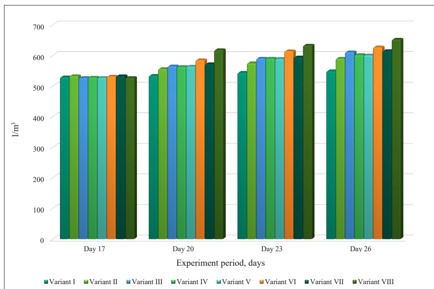
Figure 2. Volume of methane output from chicken manure in variants using the substances under study

of microorganisms that carry out transformation processes. The analysis of the obtained results shows that the substances under study, which contributed to the highest pH indicator in the fermented chicken manure, and therefore to the acceleration of bio-fermentation processes, simultaneously showed the most effective influence on the methane output increase (Fig. 2).