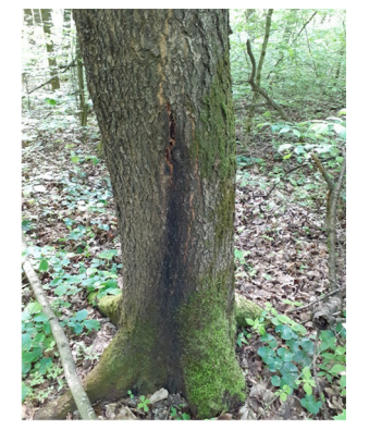
Figure 5 . Typical symptoms of the pathogenesis of transverse cancer (left) and bacterial dropsy (right) recorded on common oak