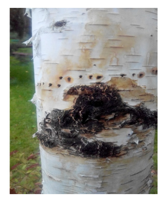
Figure 6. Symptoms of birch bacterial dropsy