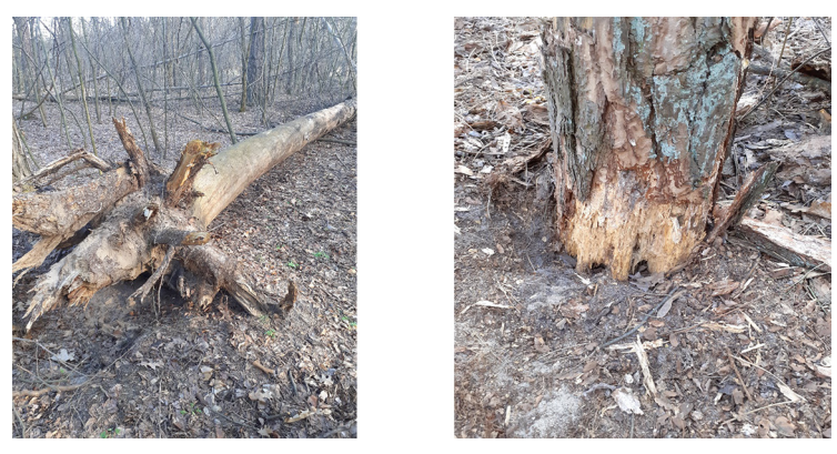
Figure 3 . Destruction of the root system and common pine fallout from the tree stand due to the influence of wood-destroying fungi

wood, significantly weakens the protective properties of forests. It is established that this pathogen causes the gradual death of arboreal plants, where over time dense stands turn into woodlands. In weakened plants, resin pressure becomes less because it is a mechanical and physiological barrier against the harmful effects of stem pests. This phenomenon is usually typical for weakened trees that grow in a state of physiological stress.