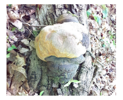
Figure 4. Basidiomas of Fomes fomentarius and Phellinus robustus

detected and identified on common oak: on the trunks and branches of living trees – Phellinus robustus , Laeti porus sulphureus and Fomes fomentarius (Fig. 4). A group of fruiting bodies of Stereum hirsutum and single fruiting bodies of Fomitopsis pinicola were also noted on dying and dead trunks.