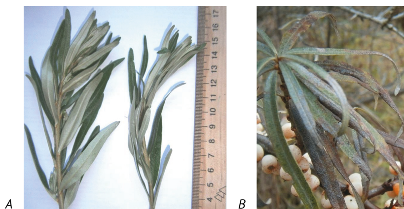
Figure 3. Leaves of sea buckthorn plants of the variety Osoblyva in the I decade of June (A) and I decade of September (B) without signs of galls caused by sea buckthorn gall mite

For sea buckthorn varieties, regardless of the maturity group, using elements of agricultural technology both individually and in combination significantly reduces damage to plants by sea buckthorn gall mites. In particular, this can be observed most clearly for the early maturing variety Rannya, the mid-maturing variety Morkvyana, and the late maturing variety Osoblyva (Fig. 3). Notably, the plants of these varieties are more tree-like, in particular, this is characteristic of the Rannya variety, thus, in the agricultural technology of cultivation, it is advisable to compulsorily loosen the soil near the trunk (Table 2).