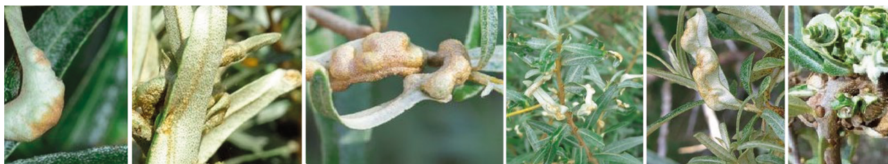
Figure 1. Leaves of sea buckthorn plants of the Adaptyvna variety damaged by sea buckthorn gall mite, the experimental field of the Institute of Horticulture of the National Academy of Sciences of Ukraine, 2020

Adult females hibernate under the covering scales of the kidneys, one of which can contain from one to several thousand individuals. In early spring, during the period of bud swelling, mites begin to lay eggs in wintering areas in the galls they form. The hatching larvae feed inside the buds, as a result of which the leaves of sea buckthorn plants that have not yet opened are completely covered with gall swellings. When the first leaves bloom (at an average daily temperature of more than 9°C and an average air humidity of 75-80%), females of the new spring generation appear, which, together with old females, move to young leaves, then concentrate mainly near the central vein, make injections and drain cell sap, eventually form galls in these places, and inhibit plant growth and development. Subsequent generations establish galls on the leaves, where the females lay eggs and the larvae that hatch from them settle on young leaves and shoots. The rounded-flat, 2-8 mm long galls first become light green, then yellowish-brown or brown, and eventually blacken and dry out. In case of severe damage, the leaves can be completely covered with galls (Fig. 1).