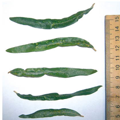
Figure 2. Leaves of plants of the variety Morkvyana with signs of damage by sea buckthorn gall mite

plants were damaged by more than 50%), while plants of the early-maturing varieties Rannya and mid-season Morkvyana are medium resistant or moderately damaged (Fig. 2).