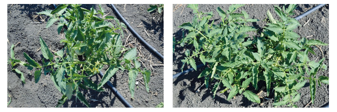
Figure 1. Example of the plants under study

in the layer 0-40 cm equal to 30.9% VWC (Harizano-va-Petrova & Ovcharova, 2015).