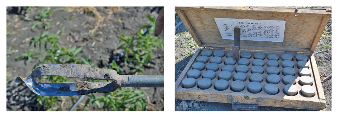
Figure 2. Equipment for gravimetric soil moisture measuring

In this study, gravimetric soil moisture was also measured. The equipment is shown in Figure 2. The value obtained for the gravimetric soil moisture in the layer 0-20 cm (the root zone for tomatoes) is 22%. This corresponds to the average value for the obtained volumetric humidity, which ranged from 15% to 22% VWC in the measurements.