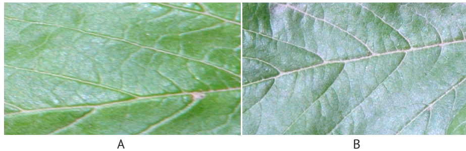
Figure 2. Part of viburnum leaf

Note: not affected (A) and affected (B) by powdery mildew