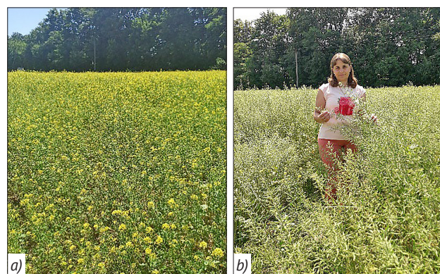
Figure 2. Sowing of white mustard on the Institute's experimental plots (2023)

The intensive development of the vegetative mass of white mustard during the years of research was ensured by a prominent level of mineral nutrition N_{110}P_{90}K_{100} and a sufficient amount of precipitation during the germination-flowering period (HTC) (Fig. 2).