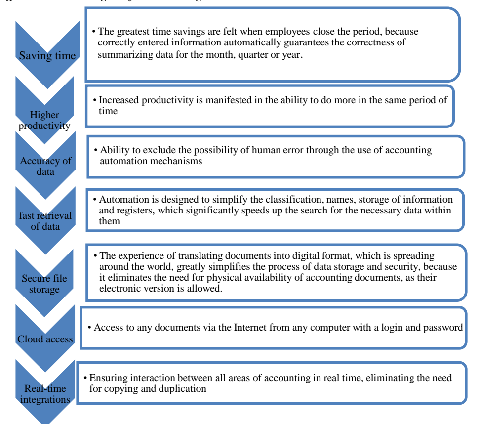
Figure 1. Advantages of accounting automation