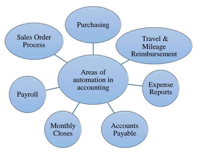
Figure 2. Key areas of concentration of automation in internal accounting