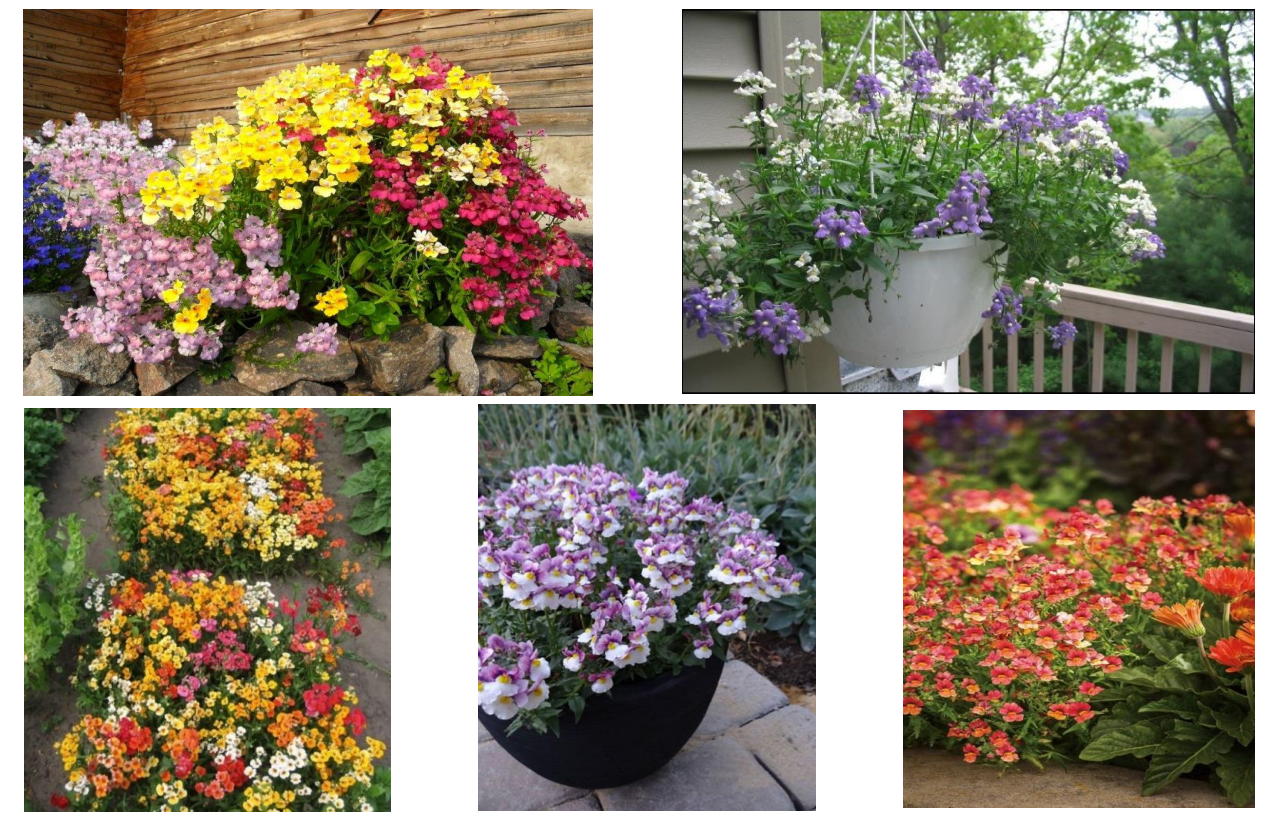
Figure 2. The use for landscaping health complexes, recreation areas, offices, and adjacent territories