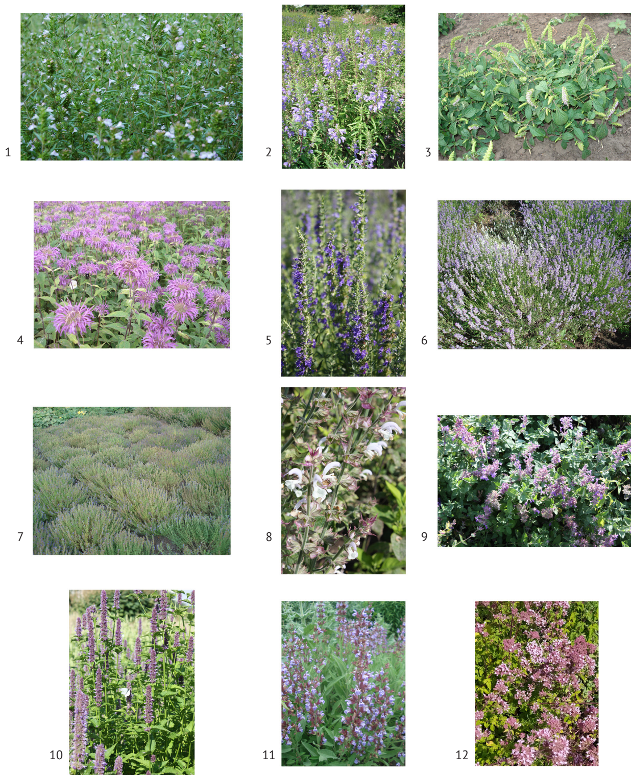
Figure 3. Aromatic plants of the Lamiaceae family in the flowering phase in the botanical garden of the Polissia National University: 1 – Satureja hortensis ; 2 – Dracocephalum moldavica ; 3 – Elsholtzia cristata ; 4 – Monarda didyma ; 5 – Hyssopus officinalis ; 6 – Lavandula vera ; 7 – Hyssopus angustifolius ; 8 – Salvia sclarea ; 9 – Nepeta transcaucasica ; 10 – Lophanthus anisatus ; 11 – Salvia officinalis ; 12 – Origanum vulgare