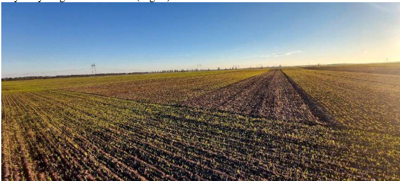
Figure. 3. Experimental plot of different varieties and hybrids of winter rye, 2024 (original photo)

To this end, a comprehensive study of the formation of productivity, growth and development characteristics, adaptive properties and competitiveness of plants of modern varieties and hybrids of winter rye in organic and conventional production has been launched in the conditions of the Levor farm in the Berdychiv district of the Zhytomyr region since 2023 (Fig. 3).